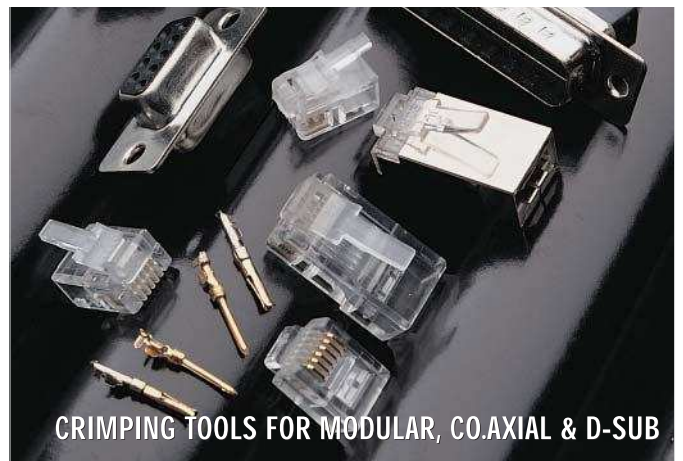
CRIMPING TOOLS FOR MODULAR, CO.AXIAL & D-SUB